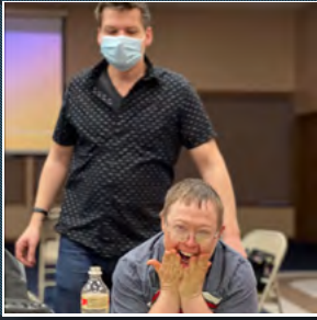
Pizza & Praise Returns Page 5