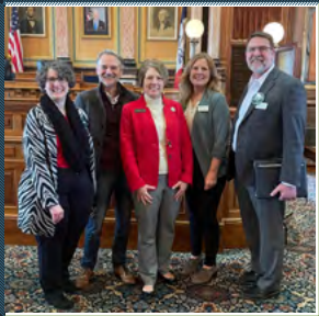
2022 IACP Hill Day Page 2