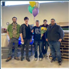
Employee Excellence Page 4