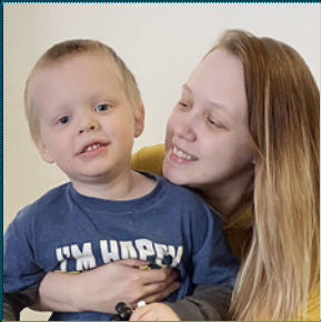
8th J. Brooks Walk-A-Block for Autism Awareness is back! Page 5