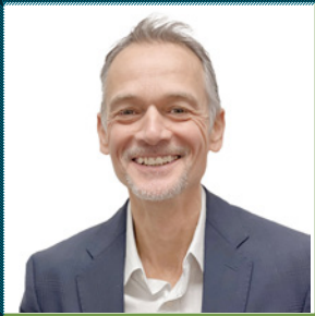
New CFO joins our mission Page 4