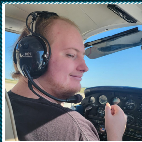
Summertime Spotlight Page 4