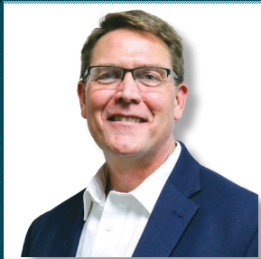
Diversity, Equity, & Inclusion Page 3