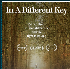
You're Invited! Navigating the Waters of Inclusion Page 5